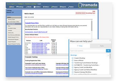
TRAMADA UNIVERSITY PORTAL